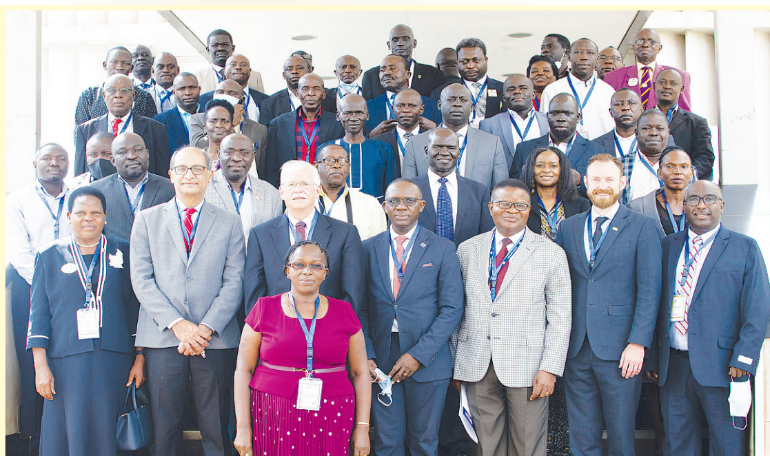
Group photo of the participants: The Committee Chair from University of South Florida, USA. It was attended by committee members and delegates from The Carter Center Atlanta - USA and Country office; USAID's Act to End NTDs/East Program, RTI International; WHO; Lions Club International; Republic of South Sudan; Democratic Republic of Congo; Ministry of Health officials and selected districts.