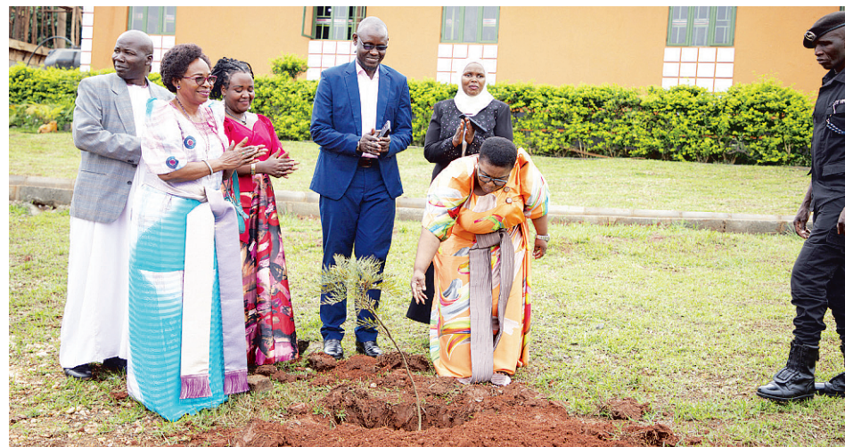
The Hon. Minister plants a memorial tree at the school compound