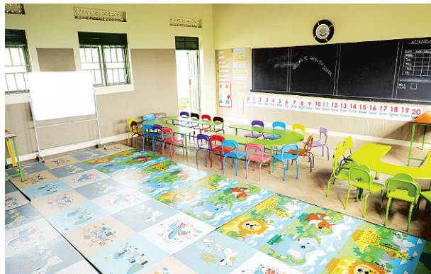
One of the classes at Green-Top School