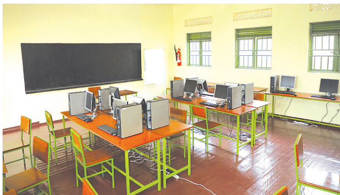
Computer learning center at Green-Top School