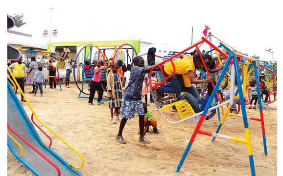
Children play area at Green-Top School (GTS)