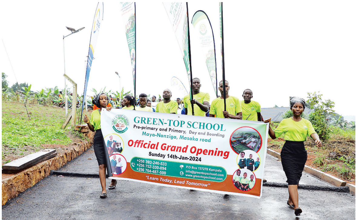
Staff of Green-Top School March during the Launch