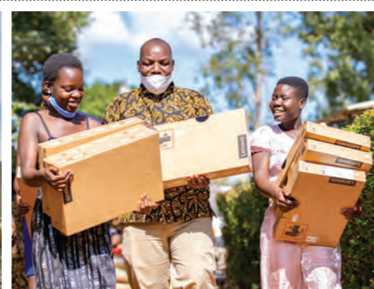
● Empowered communities through Education, Health and Environmental initiatives.