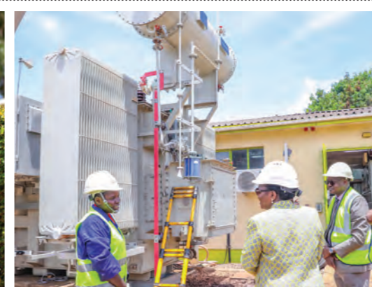
● Hon. Nankabirwa inspects Ggaba Substation upgrade in March 2025.