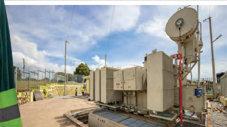
● Nakasamba Substation in Entebbe